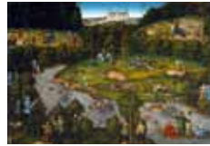
COVER: Hunting near Hartenfels Castle , 1540. Lucas Cranach the Elder (German, 1472-1553). John L. Severance Fund 1958.425

Although this scene would not have been painted directly from observation, it does offer insight into life during this period. What kinds of people are present? What are they doing? What do their clothes say about their status?