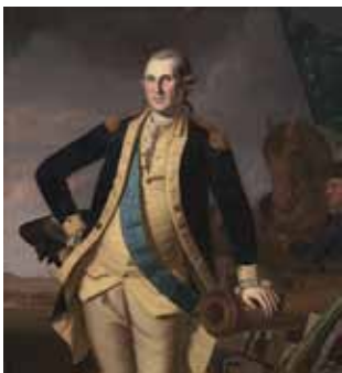
George Washington at the Battle of Princeton, c. 1779. Workshop of Charles Willson Peale (American, 1741-1827). Membership Income Fund 1917.946

How do cultures view each other? Artwork can allow us to explore viewpoints of certain people at certain points in history. Ask students to examine this 18th-century British work called Europe and America . What does it communicate about peoples' views at this time?