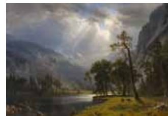
Yosemite Valley, 1866. Albert Bierstadt (American, 1830-1902). Hinman B. Hurlbut Collection 221.1922

Groupings of artworks created around the same time can often reveal details about important events. Compare and contrast this portrait with the previous portrait of George III. Using what they see, ask students to describe what kinds of things may have happened during this time. How are these men alike? How are they different? How would they have felt about each other?