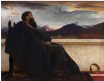
David: "Oh, that I had wings like a Dove! For then would I fly away, and be at rest." Psalm 55:6, 1865. Frederic Leighton (British, 1830-1896). Leonard C. Hanna Jr. Fund 1986.74

Artists often use the past as inspiration. Leighton, a 19th-century artist, painted this scene of King David, a ruler believed to have reigned over the Kingdom of Israel in the 10th century bc. Using evidence gained in research along with their imagination, ask students to create an image of a historical subject or time period.