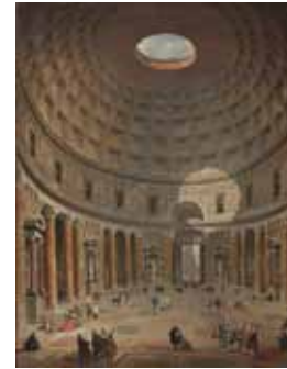
Interior of the Pantheon, Rome, 1747. Giovanni Paolo Panini (Italian, 1691–1765). Purchase from the J. H. Wade Fund 1974.39