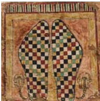
Cartonnage Mummy Case (detail), c. 50 BC–AD 50. Egypt. Gift of the John Huntington Art and Polychrome Trust 1914.715

This artist mimics the spiral pattern of a nautilus shell, where the radius of each chamber grows at a rate determined by a specific proportion to the previous one. The Fibonacci Sequence can be used to measure spiral patterns such as this. Named for Leonardo de Pisa (known as Fibonacci) in the 13th century, this sequence of numbers was also recorded in ancient Indian mathematics.