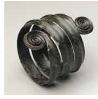
Turned Armilla, c. 1500 BC. Hungary. Purchase from the J. H. Wade Fund 1988.5

This beaded crown was worn by a Yoruba king, and the birds on top represent his ability to cross boundaries and connect with the spiritual world. Geometric patterns are used in various types of African art to symbolize power, deities, and other spiritual ideas. Explore patterns on this crown, including regular tessellations and non-regular tessellations.