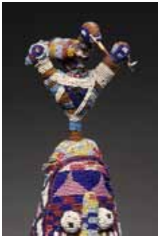
Crown (detail), 1900s. Guinea Coast, Nigeria, Yoruba. Andrew R. and Martha Holden Jennings Fund 1995.22

Explore the Golden Ratio and perspective with this painting. Roman architecture often followed the principles of the Golden Ratio, and some aspects of the Pantheon correspond to those ratios. Panini's view of the interior also shows his use of linear perspective, which was defined during the Renaissance.