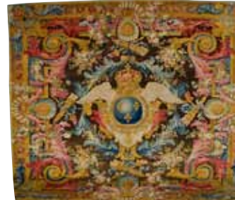
Louis XV Savonnerie Carpet with Royal Arms, c. 1740–50. Manufactured by Savonnerie Factory (French); designed by Pierre Josse Perrot (French, active 1724–1735). John L. Severance Fund 1950.8

This mummy case is made of cartonnage, a material similar to papier-mâché but using layers of linen rather than paper. On the bottom, the artist portrayed the mummy's sandals with scorpions on each side for protection. Notice the pattern on the sandals, an example of a regular tessellation composed of squares.