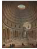
COVER: Interior of the Pantheon, Rome, 1747 ; Giovanni Paolo Panini, 1974, 39

Grades 6-7: Ratios & Proportional Relationships