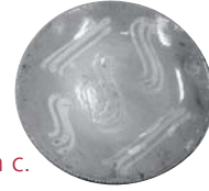
Pie Plate mid 19th c.