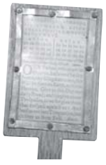
Reproduction Hornbook 20th-century replica, after an American or English original, c. 1660–80