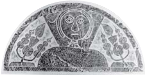
Rubbing from the Gravestone of Abigale Muzzy 20th-century rubbing of 1766 gravestone