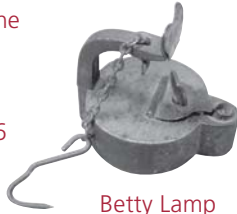
Betty Lamp 18th or 19th c.