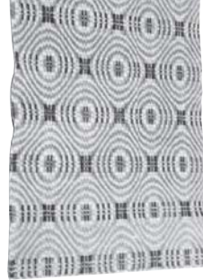
Fragment of a Coverlet early 19th c.