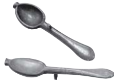
Spoon Mold early 19th c.