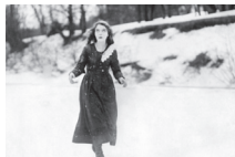
WAY DOWN EAST