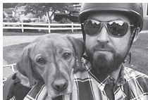
TO BE OF SERVICE