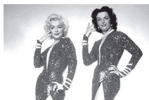
GENTLEMEN PREFER BLONDES