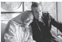
MRS. LOWRY & SON

CMA.ORG/FILMS TICKETS: 216-421-7350 or 1-888-CMA-0033 PARKING: CMA.ORG/PARKING