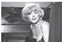
SOME LIKE IT HOT