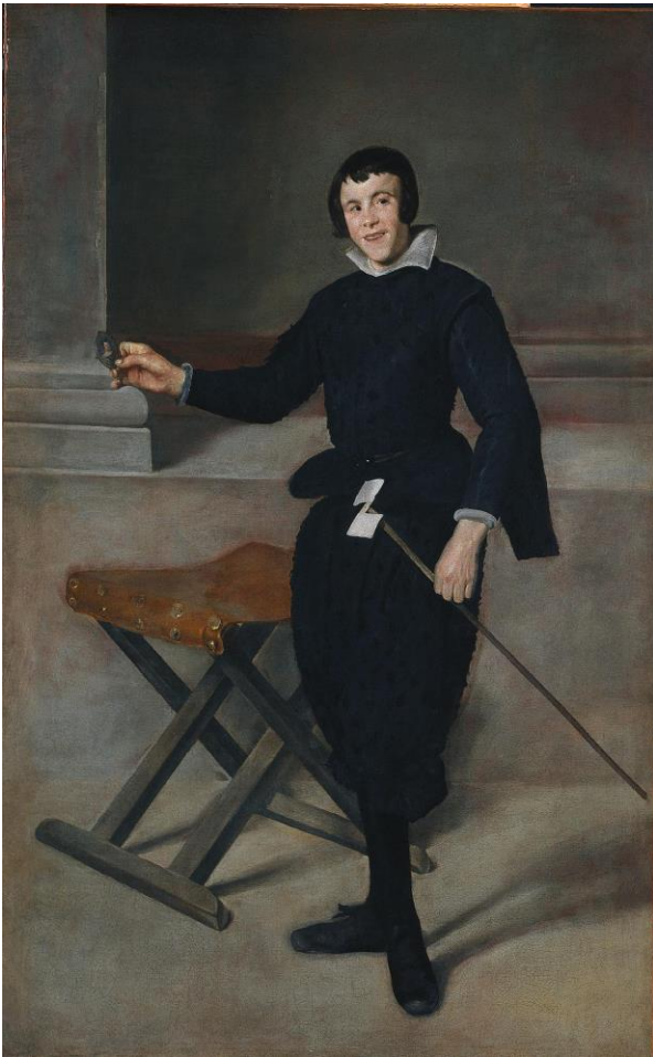
The Jester Calabazas , c. 1631-1632 Diego de Velázquez (Spanish, 1599-1660) Oil on canvas 1965.15