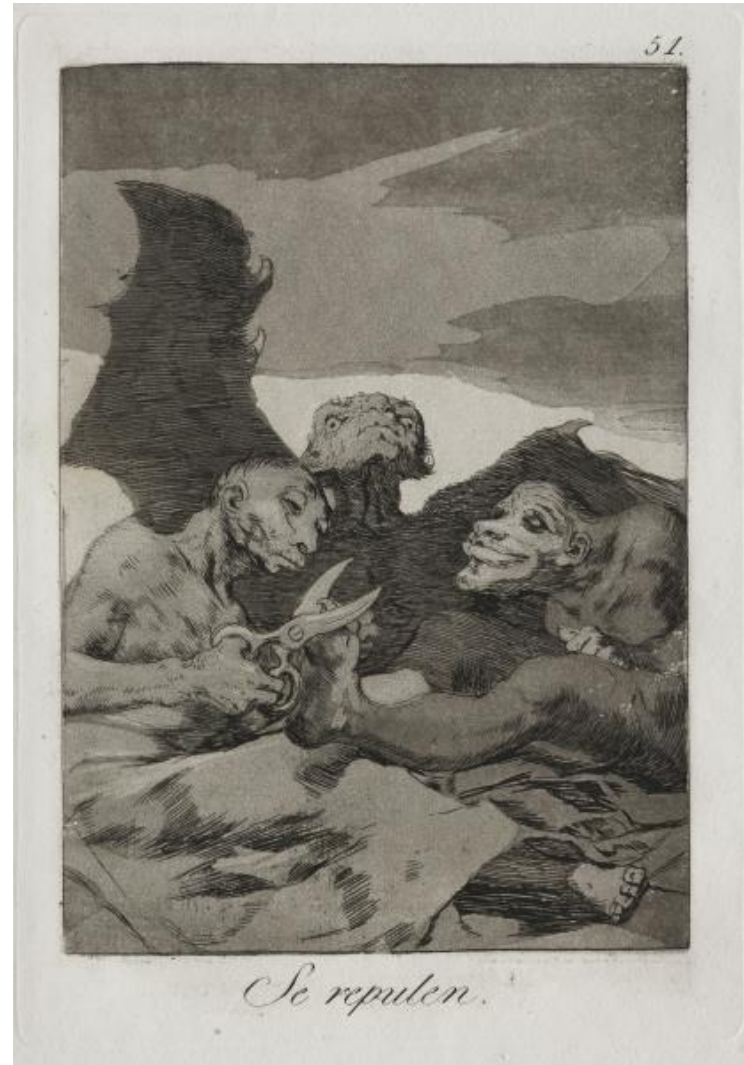
Caprichos: They Spruce Themselves Up , c. 1797-1799 Francisco de Goya (Spanish, 1746-1828) Etching and aquatint 1922.646