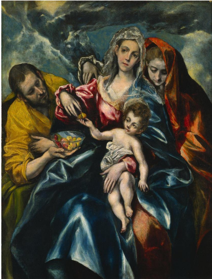
The Holy Family with Mary Magdalen , c. 1590-1595, El Greco (Spanish, 1541-1614) Oil on canvas 1926.247